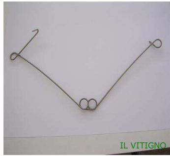
Spring for wooden posts