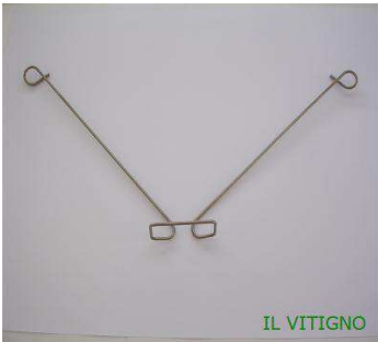
Spring for metal posts senza gancio di chiusura