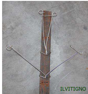
Spring for posts T